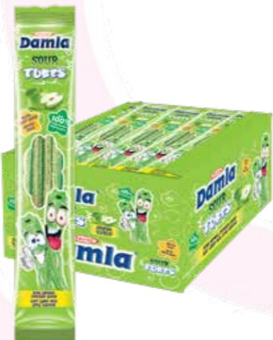
DAMLA SOUR TUBES APPLE BOX