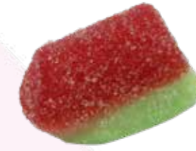
KLP32 Sour Watermelon 4 g