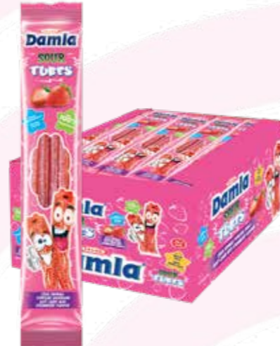
DAMLA SOUR TUBES STRAWBERRY BOX