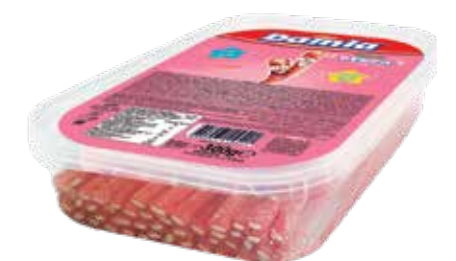
1942 DAMLA SOUR PENCIL STRAWBERRY BOX 300 G