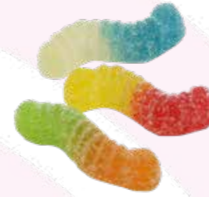
KLP37 Sour Worm 4 g