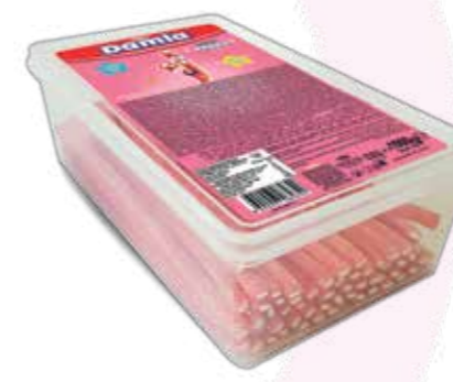
DAMLA SOUR PENCIL STRAWBERRY ■ 8484 - 1000 g (100 Pcs) ■ 1914 - 1000 g (125 Pcs)