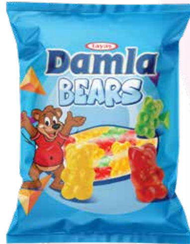
DAMLA GUMMY (OILY) BEARS 160 G BAG