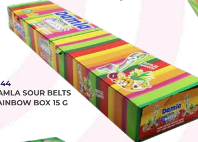
8544 DAMLA SOUR BELTS RAINBOW BOX 15 G