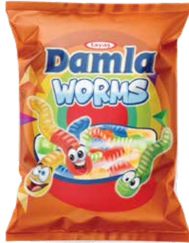
2104 DAMLA GUMMY (OILY) WORMS 80 G BAG