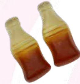
KLP35 Cola 4 g