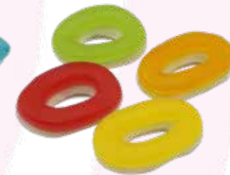
KLP28 Ring 8 g