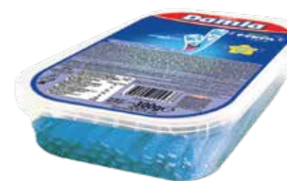
1943 DAMLA SOUR PENCIL BLACKBERRY AND RASPBERRY BOX 300 G