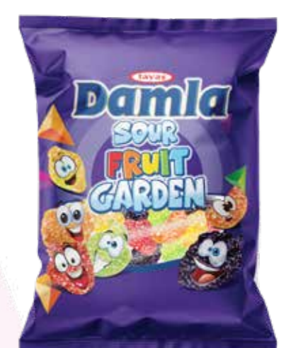
2102 DAMLA SOUR GUMMY FRUIT GARDEN 80 G BAG