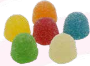
KLP65 Sour Topic 2,5 g