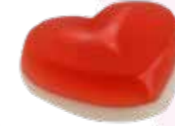
KLP Heart 4 g