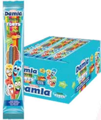
DAMLA SOUR TUBES MIX BOX