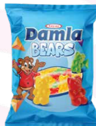
2094 DAMLA GUMMY (OILY) BEARS 20 G BAG