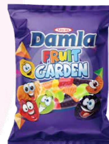
2101 DAMLA GUMMY (OILY) FRUIT GARDEN 80 G BAG