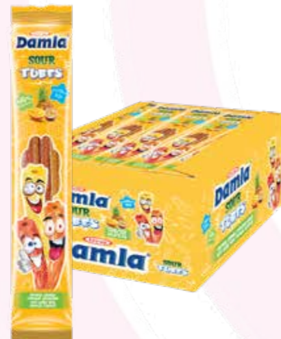
DAMLA SOUR TUBES TROPICAL BOX