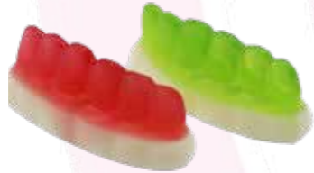
KLP17 Teeth 4 g