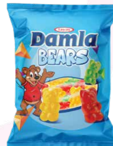
2097 DAMLA GUMMY (OILY) BEARS 80 G BAG