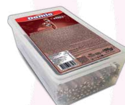
DAMLA SOUR PENCIL COLA ■ 8495 - 1000 g (100 Pcs) ■ 1917 - 1000 g (125 Pcs)