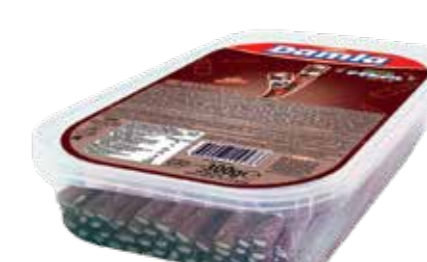
1947 DAMLA SOUR PENCIL COLA BOX 300 G