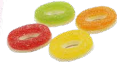
KLP28 Sour Ring 8 g