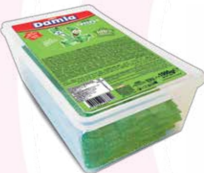
DAMLA SOUR BELTS APPLE ■ 8884 - 1000 g ■ 2278 - 1500 g