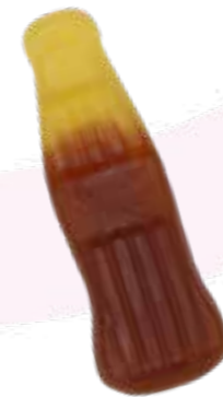
KLP Cola 18 g