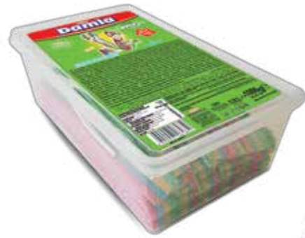
DAMLA SOUR BELTS RAINBOW ■ 8485 - 1000 g (100 Pcs) ■ 1922 - 1000 g (125 Pcs) ■ 8738 - 1500 g