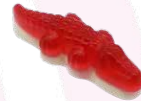
KLP62 Crocodile 7,5 g