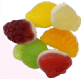
KLP44 Foam Fruit Garden 4 g