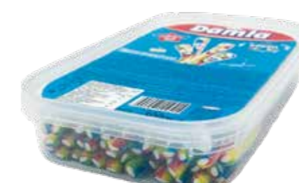
1941 DAMLA SOUR PENCIL RAINBOW BOX 300 G