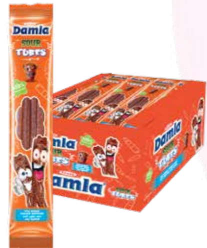
DAMLA SOUR TUBES COLA BOX