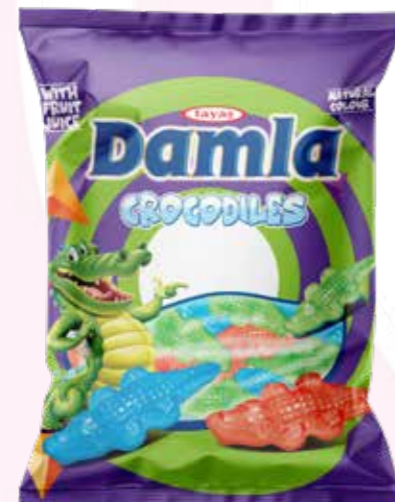
2450 DAMLA GUMMY (OILY) CROCODILES 80 G BAG