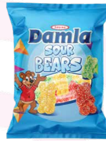
2098 DAMLA SOUR GUMM BEARS 80 G BAG