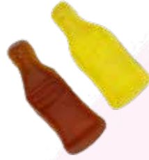
KLP34 Cola 2,5 g