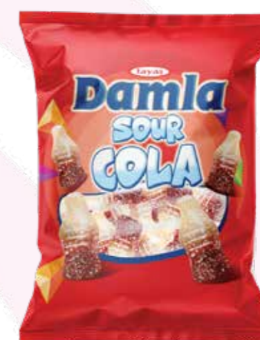
2100 DAMLA SOUR GUMMY COLA 80 G BAG