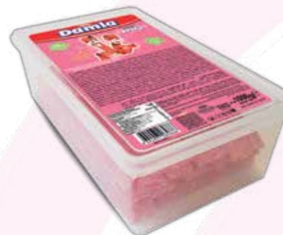
DAMLA SOUR BELTS STRAWBERRY ■ 8486 - 1000 g (100 Pcs) ■ 1920 - 1000 g (125 Pcs) ■ 2276 - 1500 g