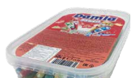
1493 DAMLA SOUR PENCIL ASSORTED BOX 504 G