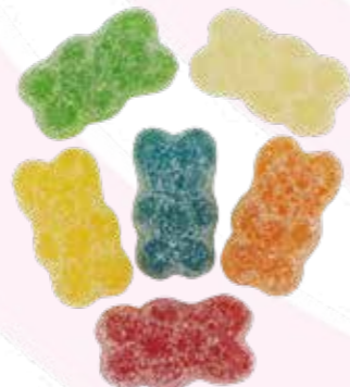
KLP03 Sour Bear 4 g