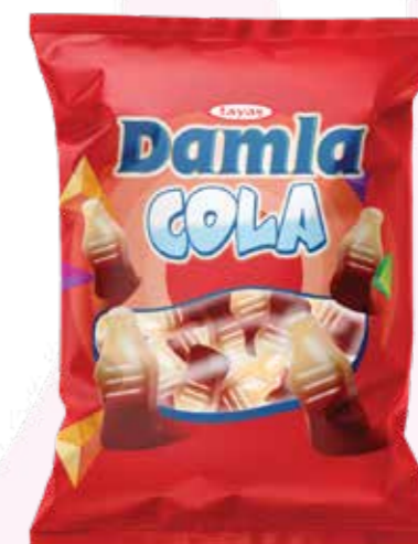
2099 DAMLA GUMMY (OILY) COLA 80 G BAG