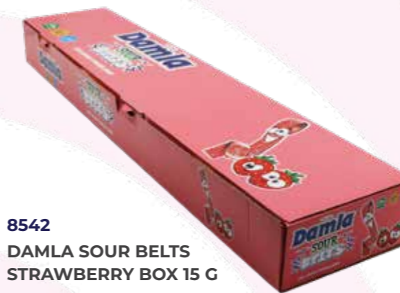
8542 DAMLA SOUR BELTS STRAWBERRY BOX 15 G