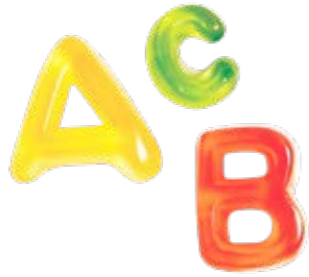
KLP01 Alphabet 2,5 g