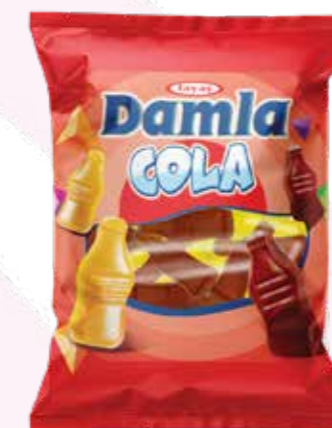
2095 DAMLA GUMMY (OILY) COLA 20 G BAG