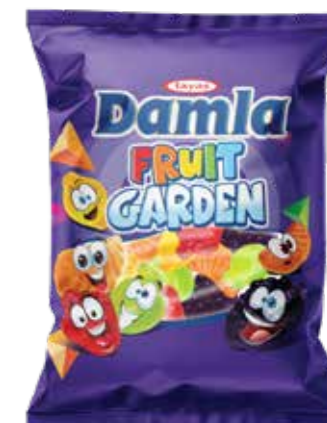
2096 DAMLA GUMMY (OILED) SMALL FRUIT GARDEN 20 G BAG