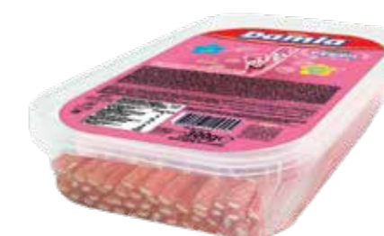
1944 DAMLA SOUR PENCIL BUBBLEGUM BOX 300 G