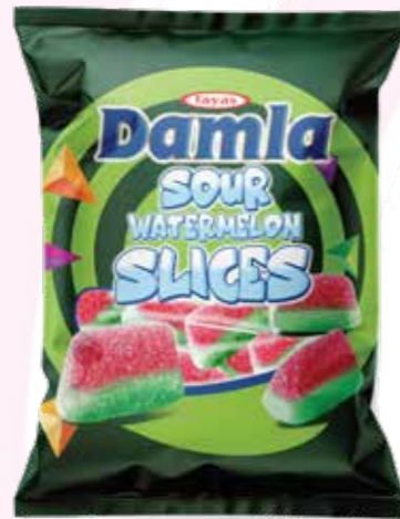
DAMLA SOUR GUMMY WATERMELON 160 G BAG