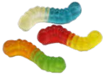
KLP37 Worm 4 g