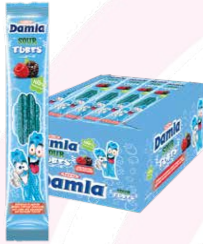
DAMLA SOUR TUBES RASPBERRY AND BLACKBERRY BOX