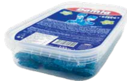
1949 DAMLA SOUR BELTS BLACKBERRY AND RASPBERRY BOX 300 G