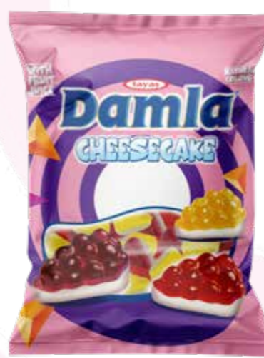
2466 DAMLA GUMMY (OILY) CHEESECAKE 80 G BAG