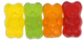
KLP02 Bear 2,5 g