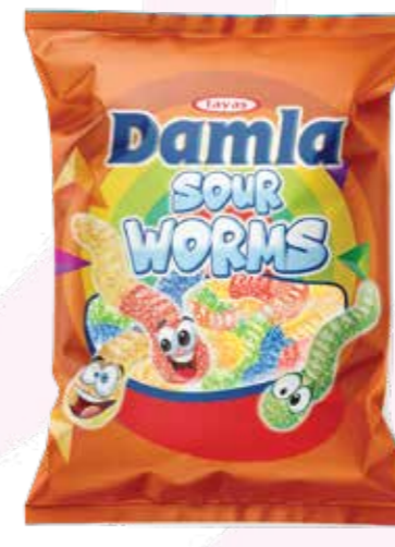
2105 DAMLA SOUR GUMMY WORMS 80 G BAG