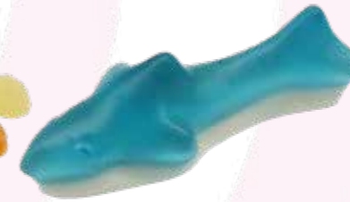
KLP36 Shark 8 g