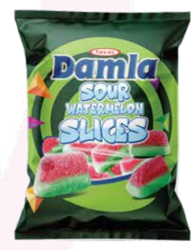
2462 DAMLA SOUR GUMMY WATERMELON 80 G BAG