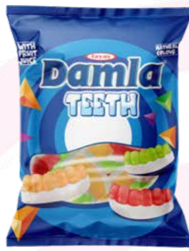
2465 DAMLA GUMMY (OILY) TEETH 80 G BAG