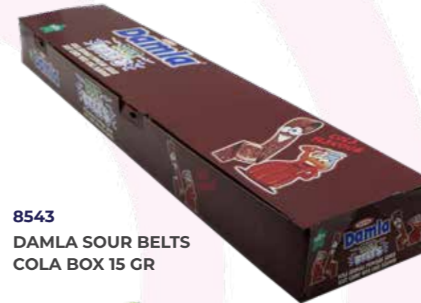
8543 DAMLA SOUR BELTS COLA BOX 15 GR