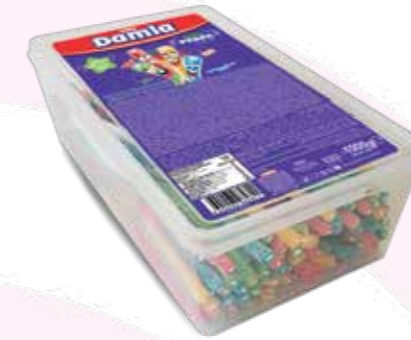
DAMLA SOUR PENCIL MIX ■ 8481 - 1000 g (100 Pcs) ■ 1915 - 1000 g (125 Pcs) ■ 8735 - 1500 g