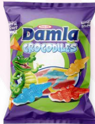
DAMLA GUMMY (OILY) CROCODILES 160 G BAG