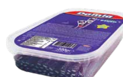
1946 DAMLA SOUR PENCIL GRAPE BOX 300 G