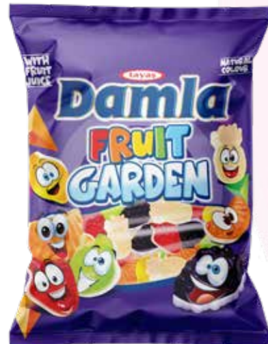
2103 DAMLA GUMMY (OILY) FOAM FRUIT GARDEN 80 G BAG