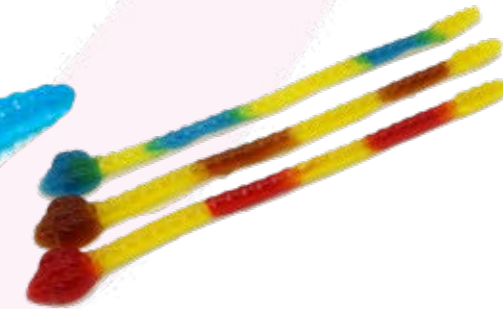
KLP33 Python 16-18 g