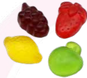
KLP44 Fruit Garden 4 g