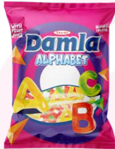
2464 DAMLA GUMMY (OILY) ALPHABET 80 G BAG