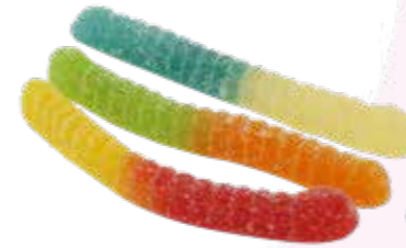
KLP59 Sour Worm 8 g