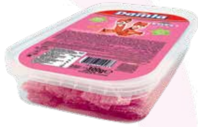
1948 DAMLA SOUR BELTS STRAWBERRY BOX 300 G