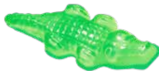
KLP71 Crocodile 4 g