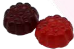
KLP67 Blackberry 4 g