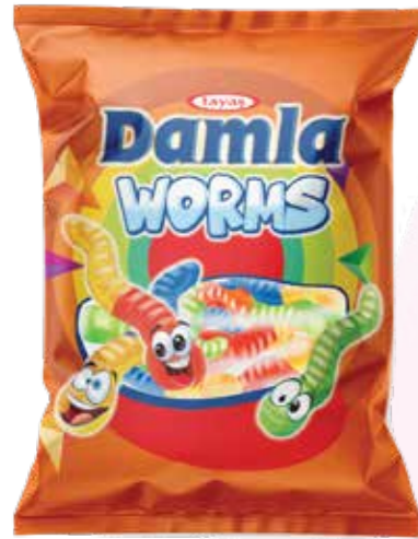
DAMLA GUMMY (OILY) WORMS 160 G BAG