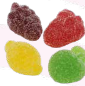
KLP44 Sour Fruit Garden 4 g