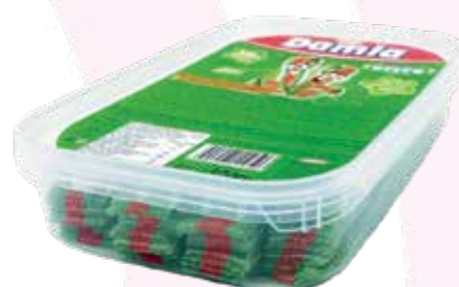
1953 DAMLA SOUR BELTS WATERMELON BOX 300 G