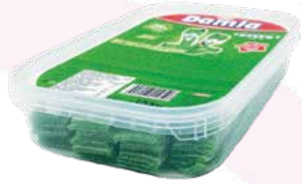
1950 DAMLA SOUR BELTS APPLE BOX 300 G