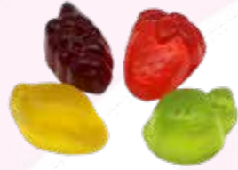
KLP43 Fruit Garden 2,5 g