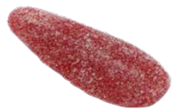
KLP16 Sour Tongue 18 g