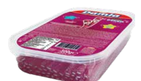
1945 DAMLA SOUR PENCIL SOUR CHERRY BOX 300 G