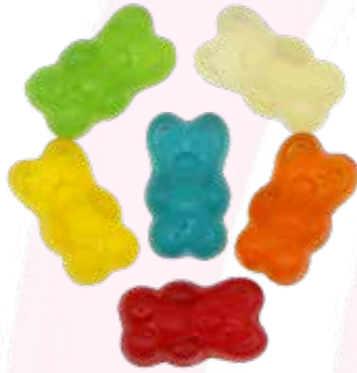
KLP03 Bear 4 g