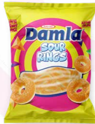
DAMLA SOUR GUMMY RINGS 160 G BAG