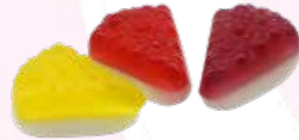
KLP06 Cheesecake 4 g