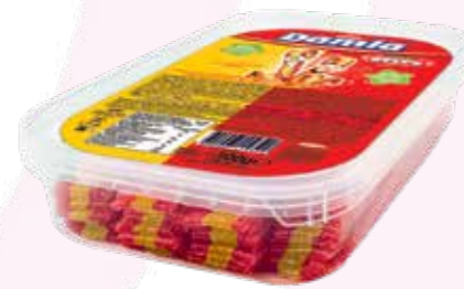
1952 DAMLA SOUR BELTS BANANA/STRAWBERRY BOX 300 G