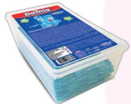
DAMLA SOUR BELTS BLACKBERRY AND RASPBERRY ■ 8488 - 1000 g (100 Pcs) ■ 1919 - 1000 g (125 Pcs) ■ 2282 - 1500 g