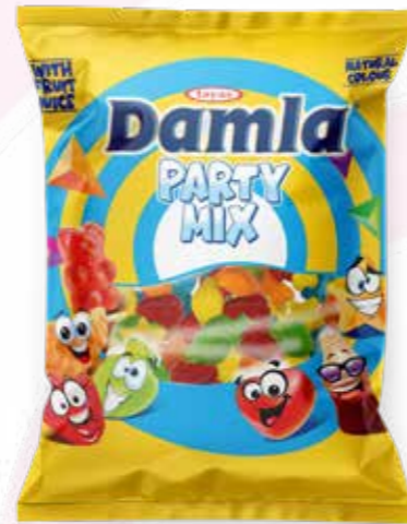
DAMLA GUMMY (OILY) PARTY MIX 160 G BAG