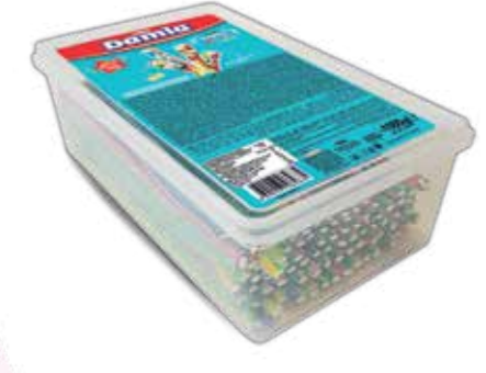
DAMLA SOUR PENCIL RAINBOW ■ 8483 - 1000 g (100 Pcs) ■ 1918 - 1000 g (125 Pcs) ■ 8737 - 1500 g