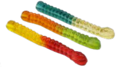
KLP59 Worm 8 g