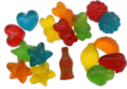
KLP66 Mix 4 g