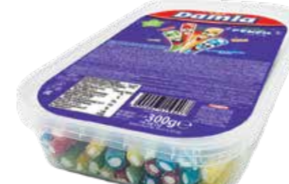
1940 DAMLA SOUR PENCIL ASSORTED BOX 300 G