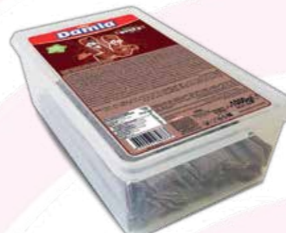
DAMLA SOUR BELTS COLA ■ 8487 - 1000 g (100 Pcs) ■ 1921 - 1000 g (125 Pcs) ■ 2280 - 1500 g