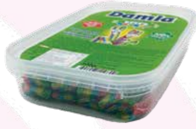
1080 DAMLA SOUR BELTS RAINBOW BOX 300 G