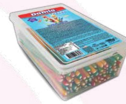
DAMLA PENCIL MIX ■ 8482 - 1000 g (100 Pcs) ■ 1916 - 1000 g (125 Pcs) ■ 8736 - 1500 g