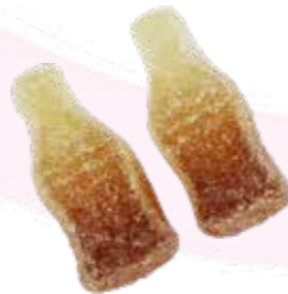
KLP35 Sour Cola 4 g