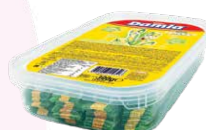
1951 DAMLA SOUR BELTS LEMON BOX 300 G