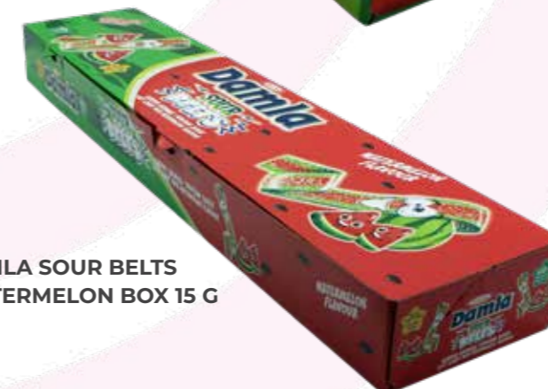
1753 DAMLA SOUR BELTS WATERMELON BOX 15 G