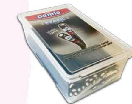
DAMLA PENCIL ANISE ■ 8734 - 960 g