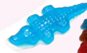
KLP61 Crocodile 16-18 g